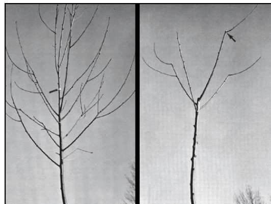
Figure 2. Two-year-old peach tree before (left) and after pruning.

Trees that have grown well for 2 years may be 5 to 7 feet tall, 6 to 8 feet wide, and have trunks 3 to 6 inches in diameter. During the second winter after planting, the trees should begin to develop secondary or subscaffold branches on the primary scaffolds. Select two or three limbs per branch that developed during the second summer. They should be spaced 6 to 8 inches apart, 18 to 24 inches from the main trunk, and on opposite sides of the branch (Figure 3). Remove all other limbs. Large, vertical-growing limbs on the primary scaffolds should be removed, leaving only the less vigorous wood for fruiting.