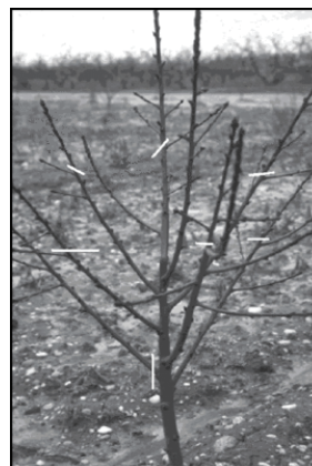
Figure 3. Pruning the second winter after planting.